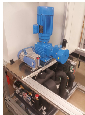
Figure 2: Vacuum pump set-up with condensing unit.

Once the concept design phase finished, the mechanical assembly stage (Fig. 2) takes a great relevance because it is the moment to introduce changes into the design after analyzing the evolution of the prototype and detecting possible defects or improvements. Parts of the mechanical frame were adapted to gain in stability and to reduce noise installing materials for vibration damping. Some other parts were relocated in order to facilitate the accessibility to every component in case they must be replaced, or distributed to ensure sufficient ventilation in the plant.