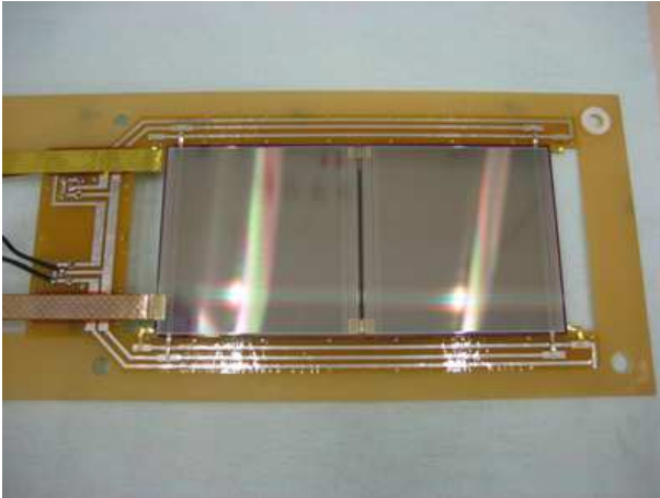
Figure 1: 2 daisy-chained 62mm sensors

The new segmentation of the CBM STS ladders [1] requires to design and produce a silicon strip sensor with 62mm width and 124mm height. This new long sensor will replace the 2 daisy-chained 62mm sensors.