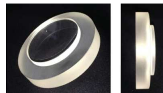
Figure 3: Photo of the novel 3-component lens prototype.

Detailed detector simulations, using Geant [2] and stand-alone ray-tracing software, are used to optimize the design configuration of the DIRC counter in terms of the performance and the best integration with the EIC detector. Fig. 2 shows the Geant simulation for the EIC DIRC in a geometry with narrow bars as radiators and compact fused silica prism as expansion volumes.