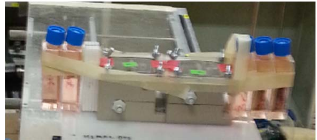
Figure 3: Example of experimental device used for verification of microenvironment adapted treatment planning: biological phantom composed by normoxic cells (tissue culture flasks) and cells at different oxygenation conditions (hypoxic chambers).