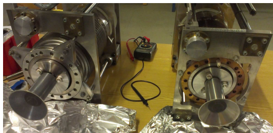
Figure 1: Two moveable PEM detector systems, used for optical diagnostics at the ESR (GSI, Darmstadt). [Now further tested at the CSRe (IMP-CAS, Lanzhou, China).]

Therefore, we have developed two different detector systems for the UV-range ( \lambda \sim 150 nm): one system uses a photomultiplier tube (PMT) and is mounted in air (on a CaF 2 viewport), the other system is based on a photo-channeltron electron multiplier (PEM) and is mounted in vacuo ( 10^{-11} mbar). Figure 1 shows two PEM systems with shielding (cage + mesh), mounted on linear translators with bellows.