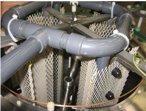
Figure 1: A CH-Cavity prepared for the Electroplating.

To comply with the requirements a couple of dummies were produced and copper plated before processing the prototype cavities.