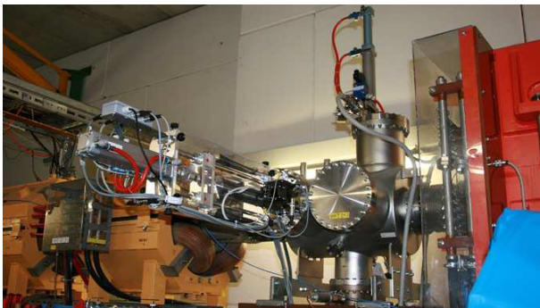
Figure 1: Scintillating Screen installation at High Energy Beam Transport Lines.

The new system (see Figure 1), including digital image acquisition, remote controllable optical system and mechanical design, was set up and commissioned during 2014 beam time. CUPID (Control Unit for Profile and Image Data) is based on the Front-End Software Architecture (FESA) to control beam diagnostic devices.