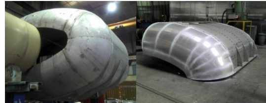
Figure 2: Vacuum vessel and thermal shield panel under construction

The main part of the cryostat is the vacuum vessel which is under construction. This part represents more than the half of the 56 tons of the magnet weight. The shape of the vessel is rather complex and the construction implements specific technologies: electron beam welding or plate shaping by explosion.