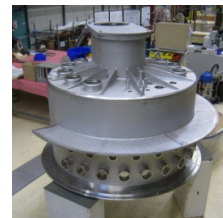
Figure 3: Magnet satellite

The superinsulation blankets which surround the thermal shield are ordered and their final design is in progress. The parts dedicated to the satellite have been already delivered at Saclay. Then the integration of the valves and the current leads will start soon.