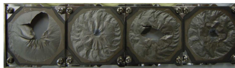
Fig. 2: Carbon foils after irradiation (5 emA \text{U}^{4+} , 1.4 MeV/u).

In November a set of thin carbon foils has been tested with a 5 emA \text{U}^{4+} beam at 1.4 MeV/u (100 \mu\text{s} , 2 Hz). Ten standard carbon foils (20 \mu\text{g}/\text{cm}^2 ), all from the same material but prepared under different conditions, mounted on a fixed carrier, have been irradiated approximately four hours each. Although some of them seemed to be unharmed after irradiation (camera in the stripping chamber), only two were actually undamaged after venting and dismantling from the vacuum chamber [Fig. 2]. This confirms the experiments from October 2011, when similar foils had been damaged after irradiation with comparable dissipated energies (about 4 \text{kWs}/\text{cm}^2 ) [Fig. 3]. Emittance measurements behind the stripper showed no significant variation during irradiation. The energy loss through the foils was typically 24 keV/u at the beginning and 22 keV/u after irradiation. Two foils from an external provider have been tested too, but broke within few pulses of beam. Further carbon foils were irradiated in the M-Branch for materials research investigations.