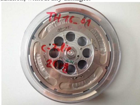
Fig. 1: TASCA target wheel after irradiation.

Thin carbon foils from the GSI target laboratory (20 resp. 30 \mu\text{g}/\text{cm}^2 ) have been tested in March in the experimental areas at TASCA (X8) and SHIP (Y7) on rotating target wheels. At X8 a low current \text{Au}^{25+} beam (4 \mu\text{A} , 3.6 MeV/u, 3 ms, 50 Hz) has been applied 24 hours on 4 foils, at Y7 a \text{U}^{28+} beam (2.5 emA, 3.6 MeV/u, 100 \mu\text{s} , 2 Hz) has been applied to 8 foils 48 hours. While the long beam pulses at X8 were evenly distributed on the moving foils (by 5 cm) [Fig. 1], the beam spot of the short 100 \mu\text{s} pulses at Y7 was scanned over the foil by the rotary motion of the wheel by shifting the phase of the target wheel. In both setups the foils showed typical characteristics of the irradiation, without any damages.