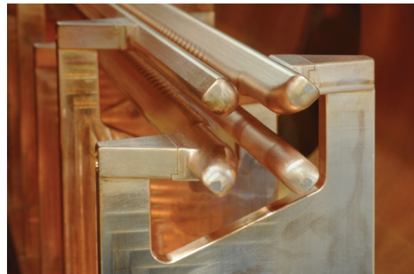
Figure 2: Final assembly inside the RFQ tank.

Each produced part was directly measured and refinished after. The ground plate of the structure was mounted on a milling machine to simulate the mounting in the tank. Every stem was individually machined and aligned to the ground plate. After this step, the electrodes were mounted and final retouching applied. Finally the whole structure was placed and reassembled inside the tank, Figure 2.