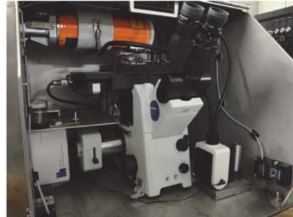
Figure 1: Open Cabinet

The new cabinet consists of an Isovolt 160M1/10-55 x-ray tube (GE Sensing + Inspection Technologies). The tube is operated by a voltage up to 35kV at a maximal current of 80 mA. Contribution of soft x-rays is minimized by an additional filtering of 0.5mm Al. At the target position of the microscope a dose rate of around 36 Gy/min can be achieved, which is sufficient for dynamic measurements which normally are performed at a dose below 2 Gy. The shielding of the housing was calculated in the radiation protection department according to these radiation parameters and safety requirements and manufactured in house. The front door of the cabinet is equipped with two independent interlock connectors with immediately power off the x-ray tube if opened accidentally. A blinking lamp on the wall signals operation. The cabinet was approved by the GSI radiation protection department, the TÜV and the radiation protection authority. For cell observation we use the same equipment as for beamline microscopy, which allows a direct comparison of results. The setup was described elsewhere [1]. Briefly it consists of an Olympus IX71 microscope (60x Planapo water NA1.2) with motorized stage and a piezo focussing system. Excitation light is provided using a fast switchable monochromator (Poly V, Till-Photonics). Image detection is done using a sensitive back illuminated EMCCD camera Andor ixon 888. The open cabinet equipped with the microscope and x-ray tube is shown in Fig. 1.